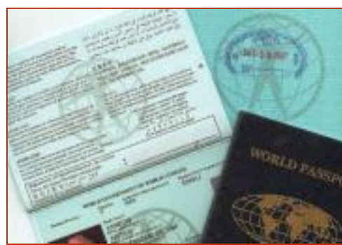
Here's your Passport to embark upon a Journey that will task your brain and...