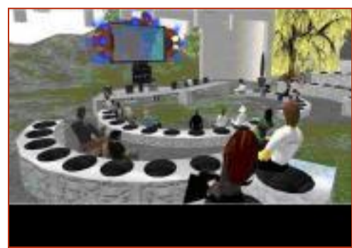
Enter & sit at the SYNCON of sovereign World Citizens. You are the Lawgivers,...